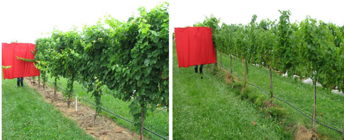
Figure 1. Vines on left are grown with an under-trellis herbicide strip (conventional); those on right utilize under-trellis cover crops. The canopy of vines on the right is more optimal (more in balance) than those on the left, which have abundant, large lateral shoots that add shade to the fruit zone.

Under-trellis cover crop also significantly reduced percent shoot-tip activity at veraison by 50% relative to Herb in 2010 (Table 1). This means that there were more shoots with actively growing shoot tips present on “herb” treatment vines than on “cc” (cover crop) vines at veraison. Both RBG-LOW and RBG-HIGH factor levels significantly reduced the number of unfolded leaves and percent shoot-tip activity at veraison in both years (Table 1). RBG had the greatest effect on vegetative growth regulation, depressing lateral leaf number by an average of 54% and shoot-tip activity by an average of 80%. Desired lateral leaves is 10 or fewer per shoot.